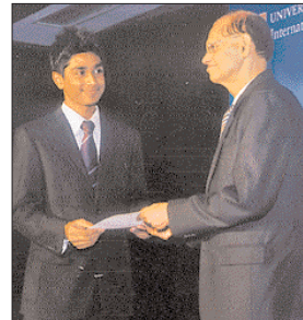
University of Cambridge International Examinations outstanding achiever awards ceremony 2009/2010 was held under the patronage of External Affairs Minister Prof G L Peiris at Ceylon Continental Hotel last Saturday. Here a student receives his certificate from Prof Peiris.