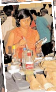
Demonstration of shoe manufacturing at the exhibition