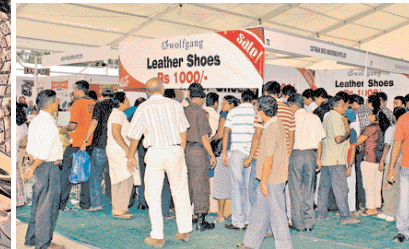
Visitors at the exhibition