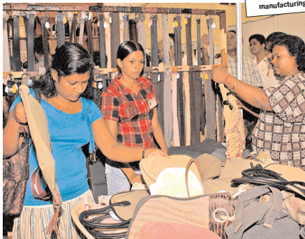
Customers busy selecting goods at the exhibition