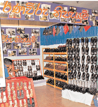
Shoes made by disabled soldiers