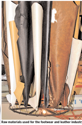
Raw materials used for the footwear and leather industry