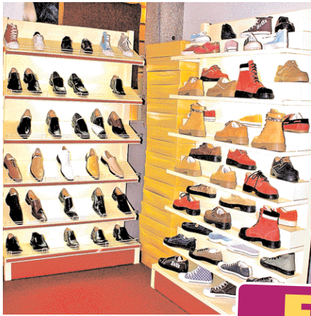
High quality shoes on display