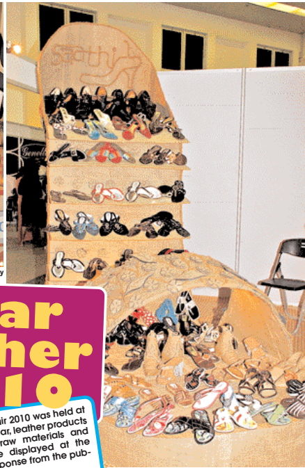
Ladies shoes on display