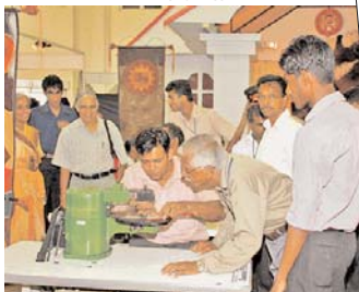
Customers eagerly examine footwear machinery on display