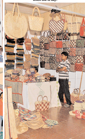
Eco-friendly bags at the fair