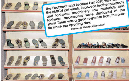
Footwear accessories on display