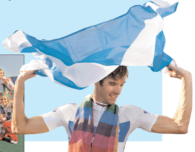
Scotland's David Millar holds his national flag after winning the gold medal during the men's individual time trial cycling award ceremony as part of the XIX Commonwealth Games in New Delhi on October 13, 2010. Scotland's David Millar won the gold medal with a final time of 47:38.66 followed by England's Alex Dowsett 48:13.48 and third Australia's Luke Durbridge with 48:19.22.