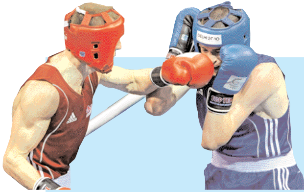
Thomas Stalker of England (L) lands a punch on opponent Josh Taylor of Scotland during their lightweight 60kg boxing bout for the gold medal for The Commonwealth Games at The Talkatora Indoor Stadium in New Delhi on October 13, 2010. Stalker won 11-3. The Commonwealth Games are taking place in the Indian capital from October 3-14.