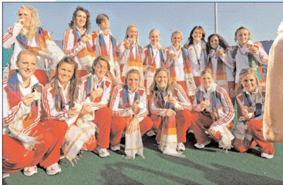
England's players celebrate with their bronze medals after the women's field hockey final match at the Major Dhyan Chand National Stadium during the XIX Commonwealth Games in New Delhi on October 13, 2010. England beat South Africa by 1-0 in the bronze final match.