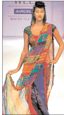
Models display creations by Indian designer Purvi Doshi