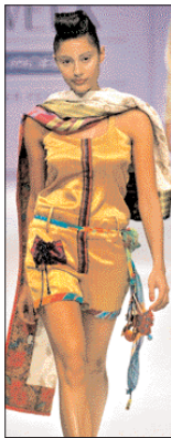
Another creation of Purvi Doshi