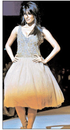
Bollywood actress Chitrangada at the fashion show