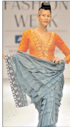
A model displays a creation by Indian designer Masaba