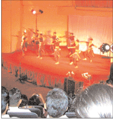
Visitors inspired by the performance