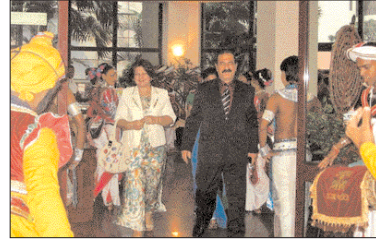
Visitors arriving to watch 'Feel Sri Lanka'

'Feel Sri Lanka' will be staged every Friday at Hotel School Auditorium, 78 Galle Road, Colombo 3 (Opposite Cinnamon Grand) 5.30 pm onwards.