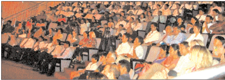
Participants at the launch

Sri Lanka Tourism will also undertake staging this on any other day for special groups including Meetings/Conference/Incentive (MICE) delegates on cost sharing basis. Here, we feature some highlights of 'Feel Sri Lanka'.