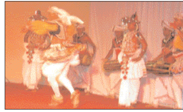
Another performance by traditional dancers