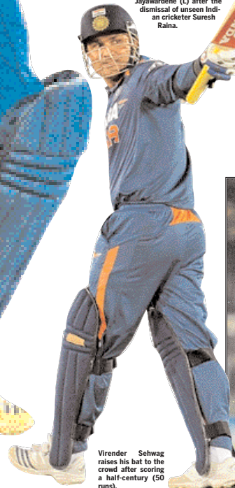
Virender Sehwag raises his bat to the crowd after scoring a half-century (50 runs).