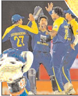
Dilhara Fernando (2R) celebrates with his teammates Suraj Randiv (R), captain and wicketkeeper Kumar Sangakkara (2L) and Mahela Jayawardene (L) after the dismissal of unseen Indian cricketer Virat Kohli.