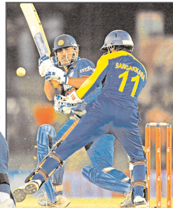
Captain Mahendra Singh Dhoni (L) is watched by Sri Lankan captain and wicketkeeper Kumar Sangakkara (R) as he plays a shot.