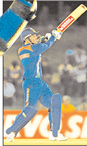
Virender Sehwag hitting a six.