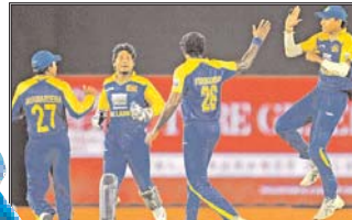
Dilhara Fernando (2R) celebrates with teammates Suraj Randiv (R), captain and wicketkeeper Kumar Sangakkara (2L) and Mahela Jayawardene (L) after the dismissal of unseen Indian cricketer Suresh Raina.