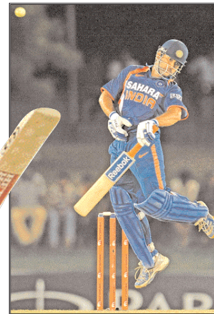
Captain Mahendra Singh Dhoni avoids a bouncer from Sri Lankan bowler Lasith Malinga.