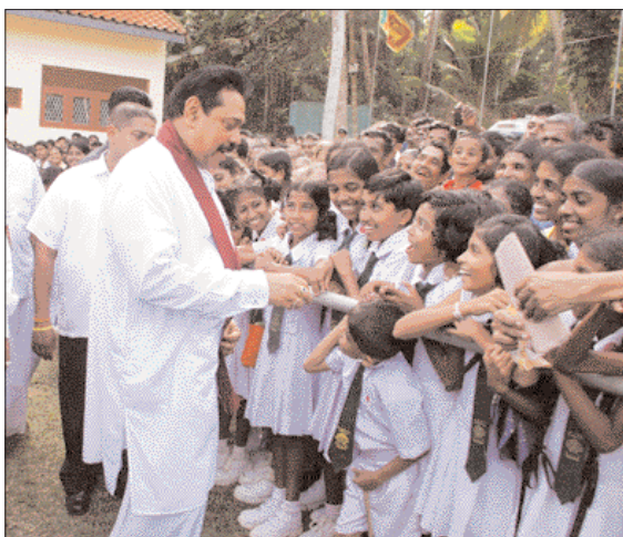
President Mahinda Rajapaksa talking to schoolchildren after opening a new school building at Kerawelapitiya, Hakmana.