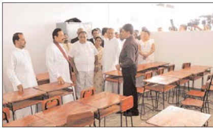
President Mahinda Rajapaksa opened the Sri Lanka-Singapore Friendship College in Weeraketiya on Sunday. The Friendship College is funded by the Singapore Red Cross Society and pioneered by the Singapore Sinhala Association. Here, the President inspecting a classroom. First Lady Shiranthi Rajapaksa is also in the picture.