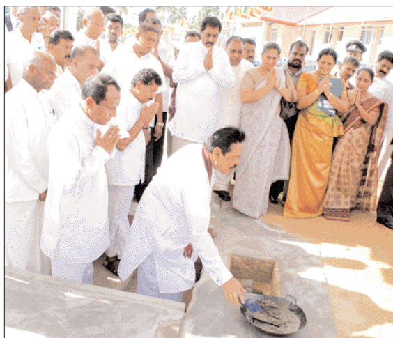
President Mahinda Rajapaksa laying the foundation for the new Town Hall complex at Hakmana.