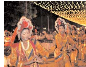
Traditional dancers at the Kataragama Esala Perahera