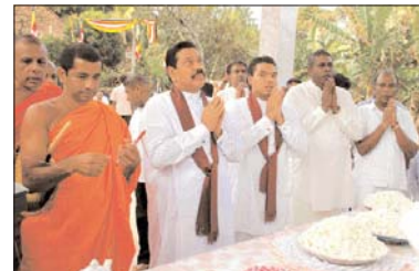
President Mahinda Rajapaksa and Namal Rajapaksa MP participating in religious observances after opening the DA Rajapaksa Commemoration Buddha statue at Julampitiya Raja Maha Viharaya.