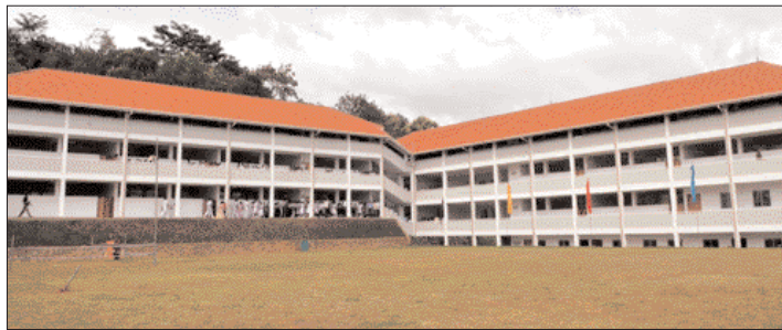
The Singapore-Sri Lanka Friendship College building