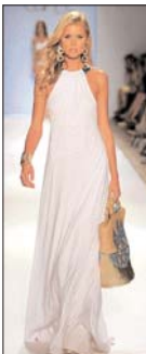
A model walks the runway during Mercedes-Benz Fashion Week Swim in Florida.