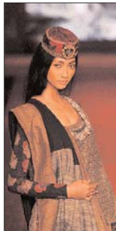
A model presents a creation by Indian designer Sabyasachi Mukherjee.