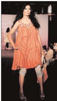
A Bangladeshi model displays an outfit during the Dhaka Fashion Week in Dhaka.