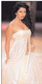
A model presents a creation by Indian designer Manish Malhotra during the Pearls Couture Week 2010 in New Delhi.