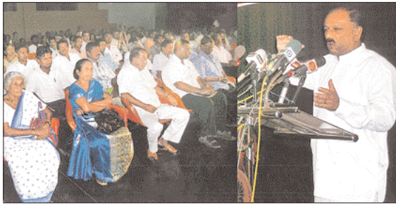
MP leader and Water Supply and Drainage Minister Dinesh Gunawardena addressing a seminar organised by the MEP on the theme "Defeat local and foreign conspiracies against the Motherland" at the Mahaweli Centre, Colombo, Thursday.