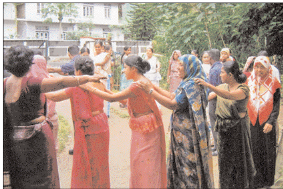
"English as a life skill" teacher training ten-day workshops are being conducted islandwide under the guidance of the Presidential Task Force and the Zonal Education Offices and are funded by the Education for Knowledge Based Society Project (EKBS). Nearly 22,000 English teachers are trained to teach English our way. Here a group of teachers who are undergoing training at the Walala Teachers Training Centre of the Wattagama Education Zone engaged in one of the out door activities.