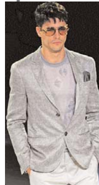
Fashion by Giorgio Armani