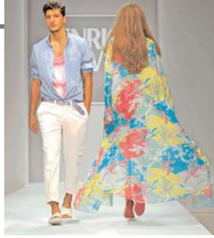
Enrico Coveri collection

This week we feature men's ready-to-wear fashion week which was held in the fashion city Milan this week. World Renowned Fashion designers unveiled their latest men's collection at the show. Here are some of the snap shots of the fashion week.