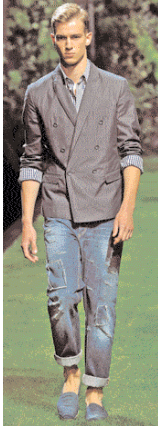
A model presents a creation of Dolce & Gabbana collection