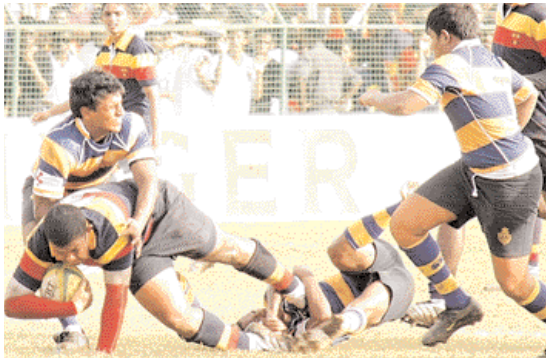
A Trinity player is well tackled by a Royalist