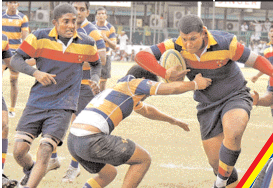
A Trinity player storms ahead evading a tackle by Royalists with support from three other players