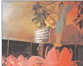
Vesak illuminations at Air Force grounds