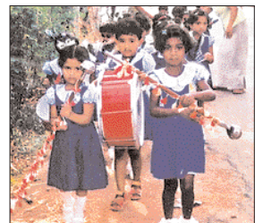
Galewela Pubudu pre-school band team participates in an event.