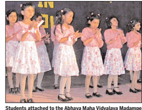
Students attached to the Abhaya Maha Vidyalaya Madampe presenting a musical item at their English Day celebrations held at the school hall.