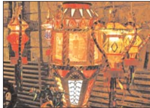
Vesak illuminations at Gangaramaya