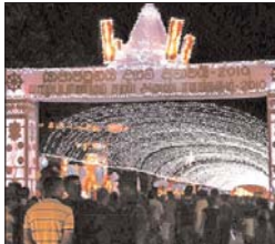
Jaffna Vesak Zone