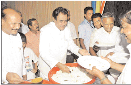
Prime Minister D. M. Jayaratne participates at the opening ceremony of the 2010 Vesak darsana organized by the Central Province Chief Minister's office.