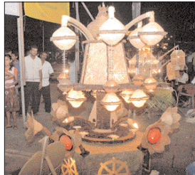
Vesak Pandal at Town Hall Picture by Saliya Rupasinghe.