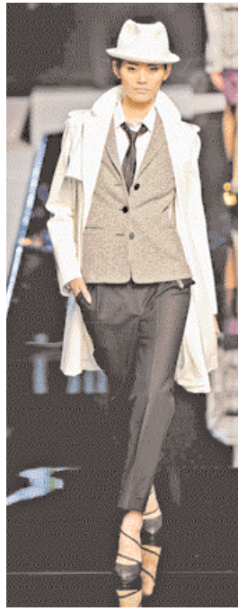
A model on the ramp displaying Christian Dior designs