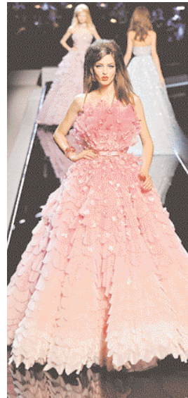
Pink outfit in Cruise collection