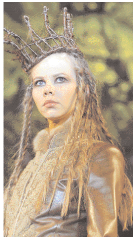
A design by Jean Paul Gaultier