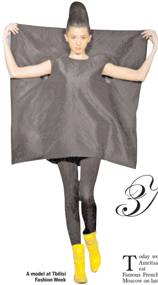
A model at Tbilisi Fashion Week