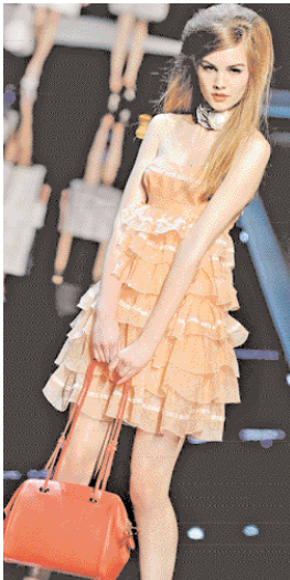
A model displays an outfit and a handbag by Christian Dior's designer John Galliano