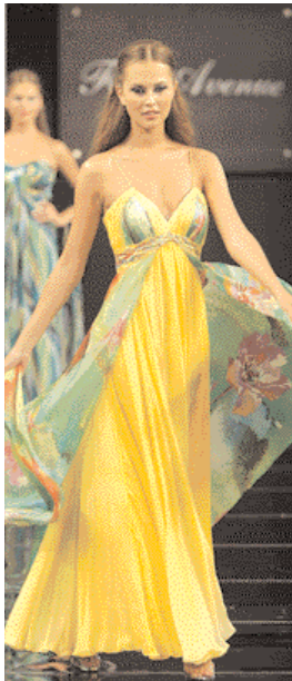
A model at summer 2010 collection of Fifth Avenue