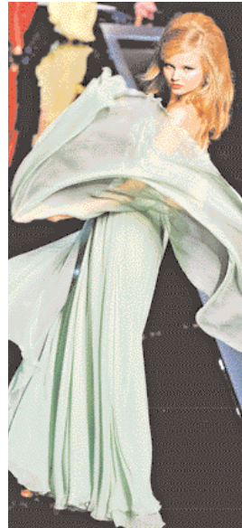
Gorgeous Green in Shanghai fashionshow