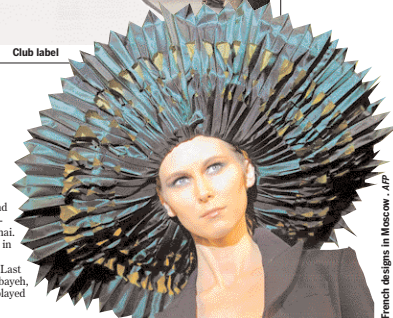
French designs in Moscow.