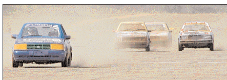
Group SL Cars up to 10-12kg/hp Upulwan Serasinghe in front