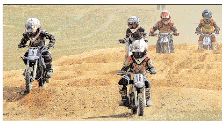
Action at the under 13 Group J Racing up to 85cc event.