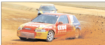
Group SL H Cars up to 1600cc - First race