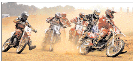
Group M STD/MOD Street Trail Bikes up to 250cc event in progress