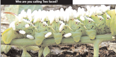
Who are you calling Two faced?