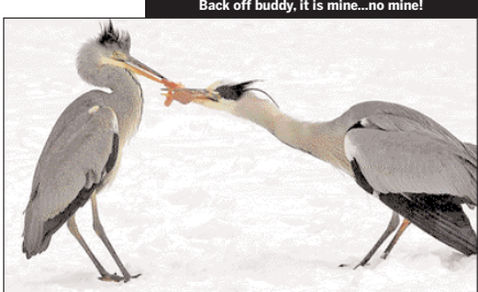
Back off buddy, it is mine...no mine!