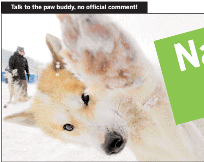
Talk to the paw buddy, no official comment!