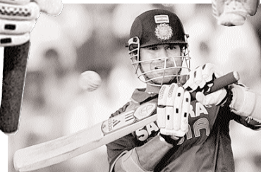
Over third man