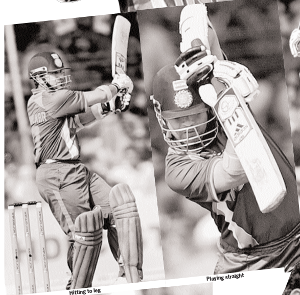
Hitting to leg