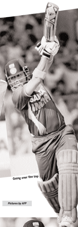
Going over the top