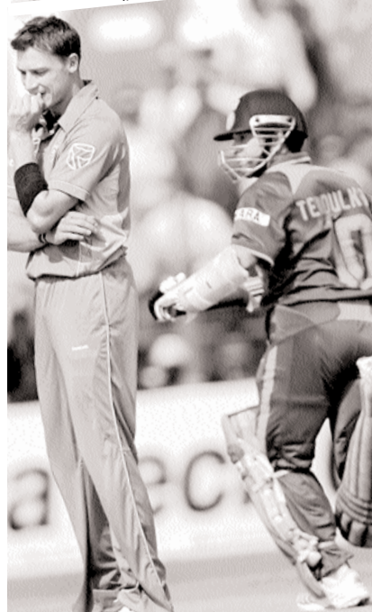
Dale Steyn watching in awe