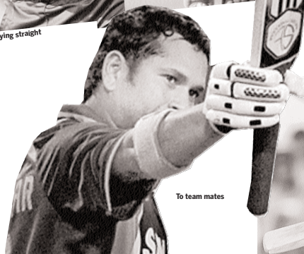
To team mates