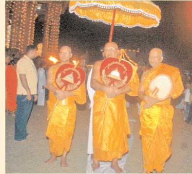
Resident monks take part in the procession