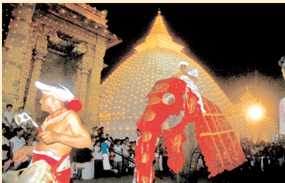
A tusker strolling along the Udamaluwa of the Viharaya