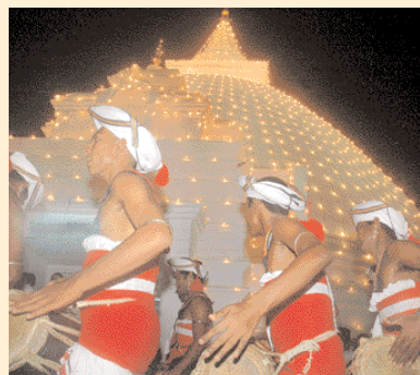
Drummers participating at the procession