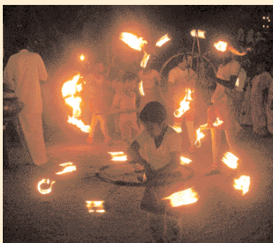
The fireworks beautifying the Perahera