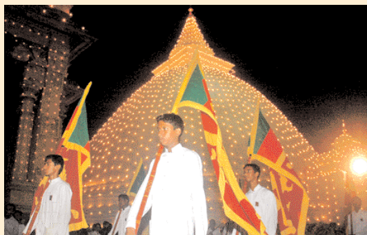
'Dahampasa' children carrying the lion flag at the procession.