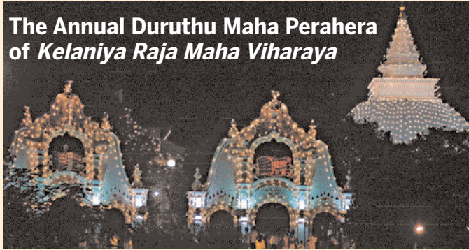
Pandals and the Chetiya being illuminated with colourful bulbs.