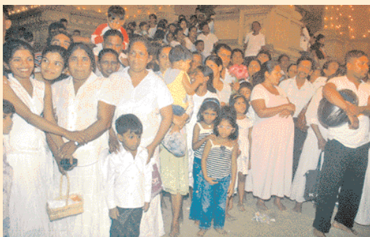
Part of the devotees present to view the procession