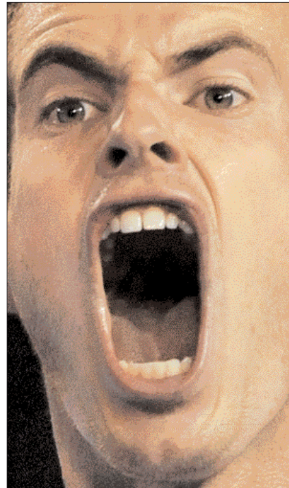
Andy Murray of Britain shouting to celebrate winning a point.