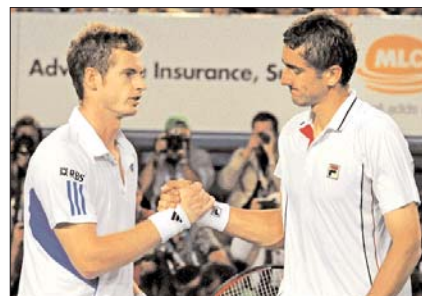
Marin Cilic of Croatia (R) congratulating Andy Murray.