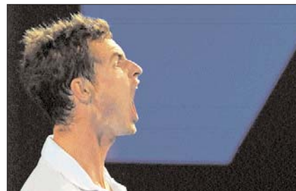
A delighted Andy Murray of Britain.