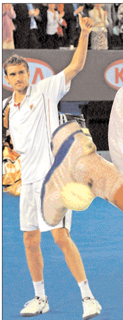
Marin Cilic of Croatia waving goodbye following his loss to Andy Murray.