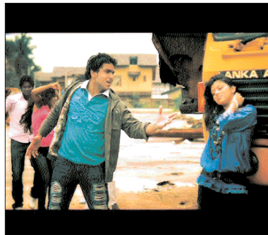
Scenes from Kadalye