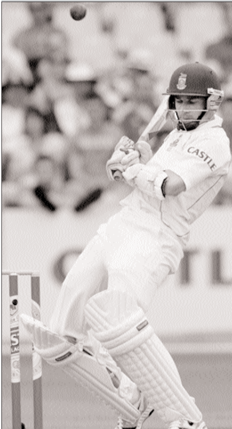
South African batsman Dale Steyn avoids a bouncer from England's bowler James Anderson (unseen) during the second day of the second Test match between South Africa and England on December 27, 2009 at the Sahara Stadium Kingsmead in Durban.