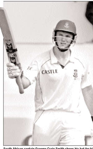
South African captain Graeme Craig Smith shows his bat for his fifty during the first day of the second Test match between South Africa and England on December 26, 2009 at the Sahara Stadium Kingsmead in Durban.