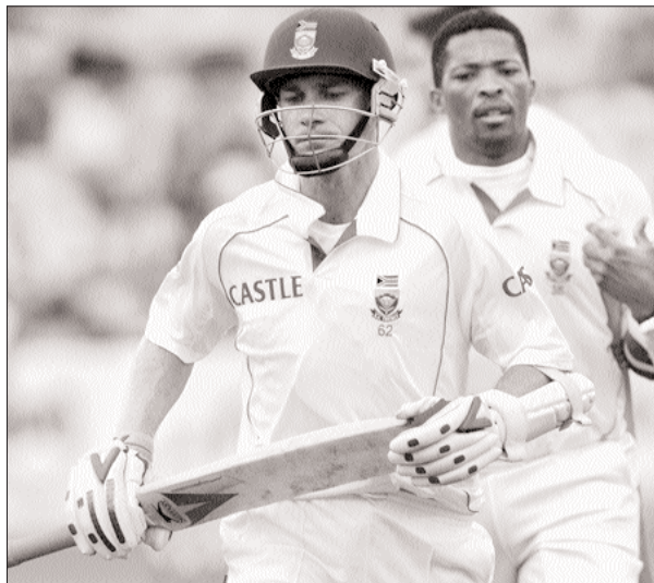
South African batsmen Dale Steyn (L) and Makhaya Ntini leave the field during the second day of the second Test match between South Africa and England on December 27, 2009 at the Sahara Stadium Kingsmead in Durban.