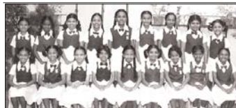
The Methodist Primary School at Panadura won first place at the all island Dance and Ballet Contest 2009 in the Western Province. Here the winning group.