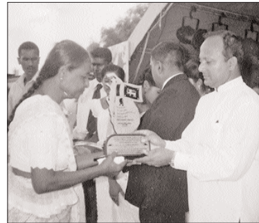
A Ranaviru Upahara ceremony organised by the Chilaw Urban Council to pay tribute to war heroes from the Chilaw area was held at the Chilaw Urban Council grounds recently. Here Deputy Fisheries Minister Neomal Perera who was the chief guest handing over a memento to a mother of a war hero during the awards presentation.