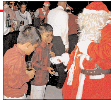
Santa greeting the children at the Galle Face Hotel