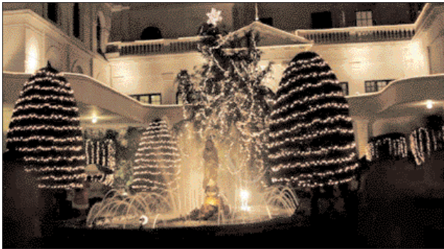
Mount Lavinia Hotel lit with the traditional Christmas lights