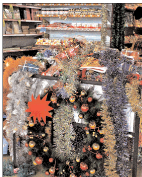
Christmas decor- where a tree would be empty without them