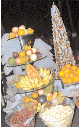
A feast to your eyes

Sri Lanka's Heritage in Hospitality where East meets West, the people at Galle Face Hotel offers its guests a bountiful Xmas Rendezvous this festive Season - "Keeping the Tradition Alive" is this year's Theme.