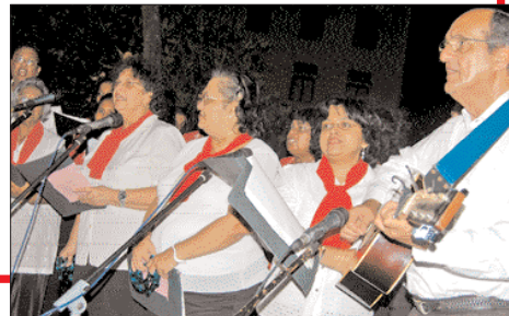
Carols being sung at the lighting of the Red Lantern ceremony.