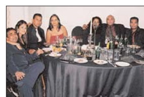
A section of the guests.

A host of distinguished guests and pupils of Prince Ratnam Dancing Club graced the occasion. Scintillating music was provided by Super Pink N' purple band. Many colourful competitions were on the cards and winners were presented valuable gifts.