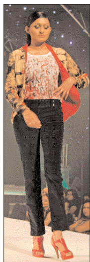
Models in diverse colourful shades on the catwalk.