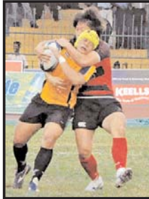
A Thailand player is well tackled by a South Korean defender in the Carlton Asian Sevens Plate championship final which the former won 15-12.