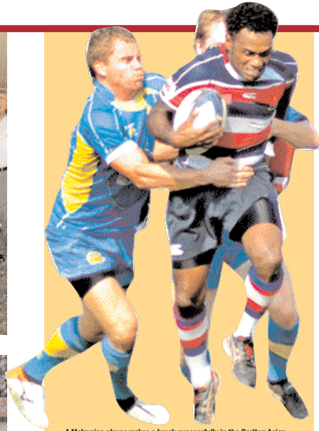
A Malaysian player makes a break successfully in the Carlton Asian Sevens Cup championship semifinal match against Kazakhstan