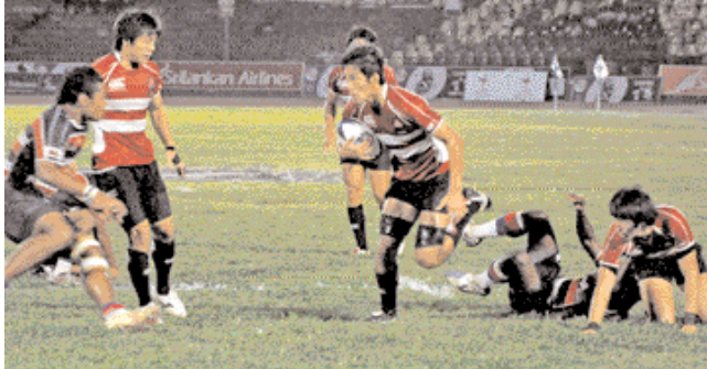
A Japanese player makes a powerful break successfully after receiving a pass from his teammate in the Carlton Asian Sevens Cup championship final against Malaysia.