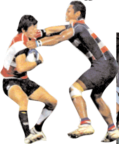
A Japanese player is well held by his opposite number from Malaysia in the Carlton Asian Sevens Cup championship final which Japan won 26-7.