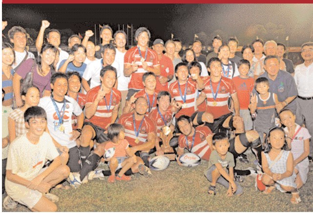
The victorious Japan rugby team celebrating after they beat Malaysia 26-7 in the Carlton Asian Sevens Cup championship final.