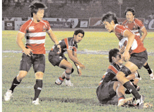
A Japanese player is about to score a try in the Carlton Asian Sevens Cup championship semifinal match against Chinese Taipei.