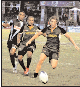
A South African "Vipers" player is about to pick up the ball in the face of opposition from Fiji "Barbarians" who clinched the International title with a 38-12 victory.