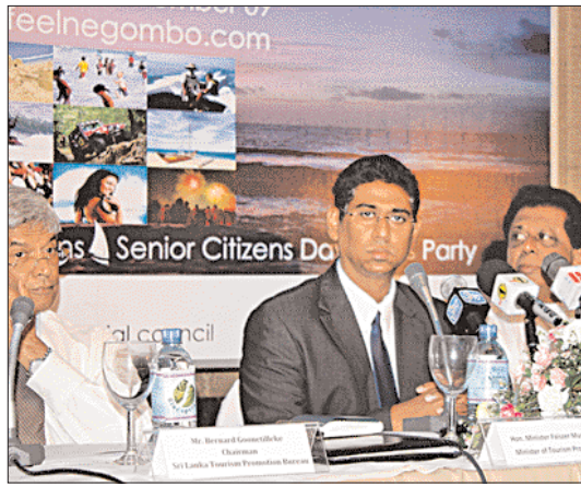
Minister of Tourism Promotion Faiszer Musthapha speaking at a press briefing recently regarding Feel Negombo 2009, a family oriented event is set to take place from December 11 to the 13th.