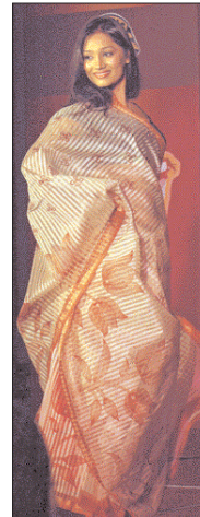
Celebrities taking the ramp and modelling some saris