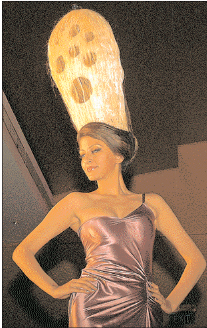
A model showcasing Avant Garde, a sculpted strong hair shapes combining Geometry with beauty.