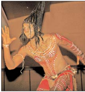
A model performing a dance from the Tribes selection