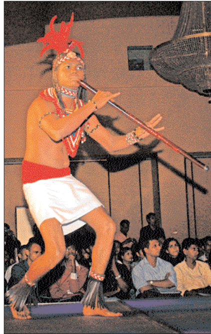
Models performing a dance from the Tribes selection