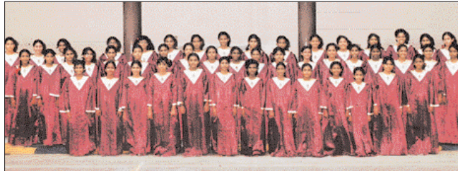
The Choir Concert "Voce Cantabile" organized by the Choristers of St. Lawrence's Convent, Colombo 6 with the participation of students of St. Bridget's Convent, Colombo 7, St. Peter's College, Colombo 4, St. Joseph's College, Colombo 10 and St. Sebastian's College, Moratuwa will be staged at the BMICH on November 3 at 6.00 p.m. This is an evening of Choral Excellence. Nearly 25 songs will be sung by the choristers, which are religious, classical and popular songs.