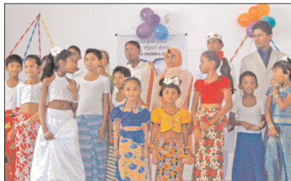
Students of the National Bahai Centre along with children of the Rehabilitation Centre for the Communication Impaired (RCI) celebrated World Children's Day recently at the National Bahai Centre, Colombo 05. The morning was a celebration of all children regardless of their ethnic backgrounds, religious or physical abilities and this was clearly demonstrated by the beautiful musical and dance events that were showcased. Here a section of the children who participated at the event.