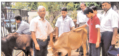
A ceremony was held by donors and members of the Matara YMBA to release two cows from the slaughter house on Binara Poya day to bestow merit on the Nation, the Armed Forces and the President - Here a volunteer accepts a cow.