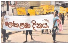
A children's walk organised by the Reader's Club of the Peliyagoda Urban Council was held at Peliyagoda in connection with World children's Day.