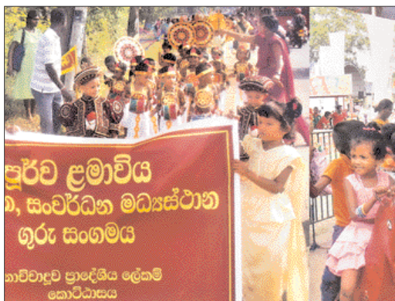
Montessori children attached to pre-schools in the Nachchaduwa, Wilachchya, Rambawa and Noochiyagama areas celebrated 'Universal Children's Day' at the Prison Grounds in Anuradhapura recently.