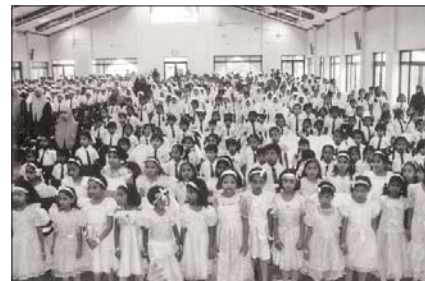
Students of K/Madina Central College (National School) primary section celebrated Universal Children's Day at the Ashroff Memorial Auditorium with teachers and the parents.