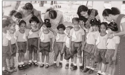
Giggles International pre-school, Matara celebrated International Children's Day recently with a series of special features conducted by the children. Here, the head mistress and teachers participate in an event.