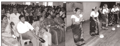
Pannala Elders Organizations Balamandalaya organised an elders variety entertainment under the patronage of Pannala Divisional Secretariat to mark World Elders' Day. Officials enjoy the entertainment (left). The kalagedi netuma performed by Makandura Elders organization (right).