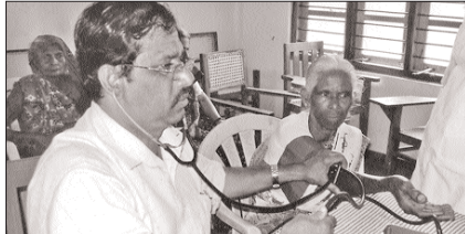
The Vavuniya Divisional Secretariat organized a medical clinic for elders at the Vyravupuliyam Kulam Rural Development Society hall. A large number of elders participated in the clinic. Doctors from the Vavuniya General hospital were in attendance.