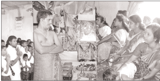
A Saraswathi Pooja organised by the students and teachers of St. Don Bosco's College, Hatton was held at the main hall of the college recently. Here the priest of the Thirukkal Amman Kovil at Hatton conducting the Pooja.