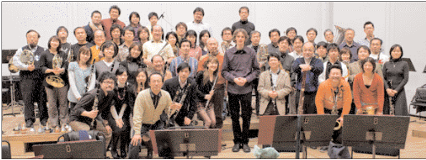
The Tokyo Kosei Wind Orchestra (TKWO)