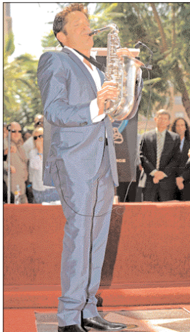
Jazz musician Dave Koz performs after being honoured by a star Hollywood. Dave performs after being honoured by a star on the Hollywood Walk of Fame in Hollywood, California.