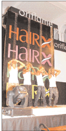
A live shower demonstration at the launch of Hair X by Oriflame

Oriflame introduced Hair X, a complete Hair Care system to local market last week. Our aim is to keep abreast with the latest trends. Present market conditions in Sri Lanka are very conducive as there is an increase in purchasing power in the relevant target segments. Here some of the snap shots of the launching ceremony.