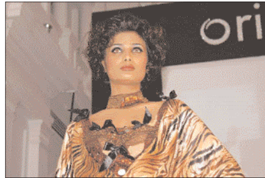
Model displaying latest fashion