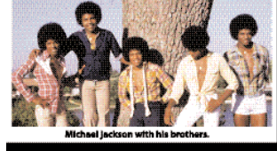
Michael Jackson with his brothers.

Following his death, U.S. President Barack Obama sent a letter of condolence to the Jackson family, and during a press conference the Press Secretary Robert Gibbs said that President Obama viewed Jackson as a "spectacular performer and a music icon". www.ims.com