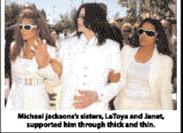
Michael Jackson's sisters, LaToya and Janet, supported him through thick and thin.