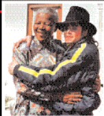
US pop star and entertainer Michael Jackson (R) poses with Nobel Prize winner Nelson Mandela (L) in Kwanulu-Natal on July 20, 1986.

A musical prodigy, Michael's singing and dancing talents were amazingly mature, and he soon became the dominant voice and focus of The Jackson 5. An opening act for such soul groups as the O'Jays and James Brown, it was Gladys Knight (not Diana Ross) who officially brought the group to Berry Gordy's attention, and by 1969, the