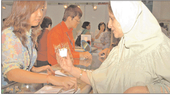
A customer selecting jewellery