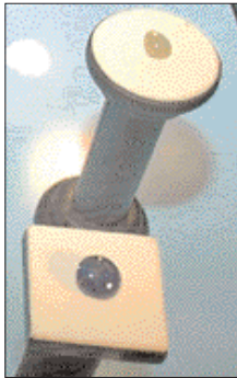
Some valuable gems on display