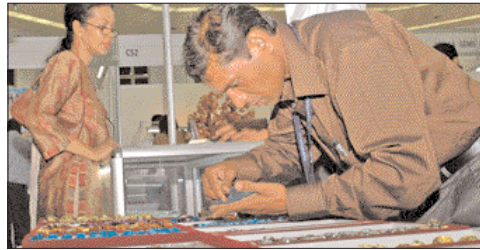
A stallholder attending to customers