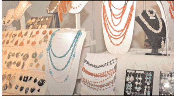
Attractive jewellery designs.