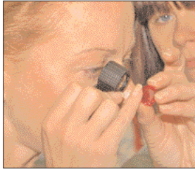
A foreigner having a closer look