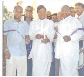
Trade Marketing Development, Co-Operatives and Consumer Services Minister Bandula Gunawardena cuts a ribbon to open a BMC outlet in Anuradhapura recently. NCP Chief Minister Berty Premalal Dissanayake and Petroleum Resources Minister Duminda Dissanayake are also in the picture.