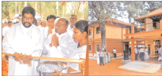
Minister of Religious Affairs Pandu Bandaranyake cutting the ribbon to open the Ministry's first holiday home at Kurundankulama in Anuradhapura amidst seth pirith chanted by the Maha Sangha. NCP Governor Karunaratne Divulgane and Chief Minister Berty Premalal Dissanayake were also present (Right). The new circuit bungalow situated at Kurundankulama along the Anuradhapura, Mihintale main road.