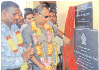
A 'Vidhatha' resource centre costing Rs. 16 million was opened by NECCDEP in Palamunai. Here Minister of Water Supply and Drainage A.L.M. Athaulah and Eastern Provincial Minister M.S. Uthumalebbe opening the building.