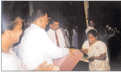
Computers were provided to Grama Niladharis in the Kandy District by Minister of Public Administration Dr. Sarath Amunugama at a ceremony organised by the District Secretary of Kandy held at the Kandyan Arts Centre, in Kandy. Here Minister Dr. Sarath Amunugama handing over a computer to one of the selected Grama Niladhari.