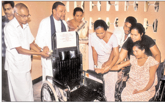
Ten wheelchairs were distributed to disabled persons to mark the 15th anniversary of Indigenous Medicines Minister Tissa Karalliyadda's political career at a ceremony held at Maharagama Navinna Ayurveda Hospital recently. Here the Minister hands over a wheelchair to a disabled lady.