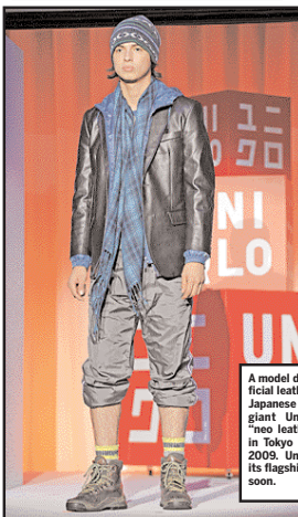
A model displays an artificial leather jacket from Japanese casual apparel giant Uniqlo at their "neo leather" collection in Tokyo on August 26, 2009. Uniqlo will open its flagship shop in Paris soon.