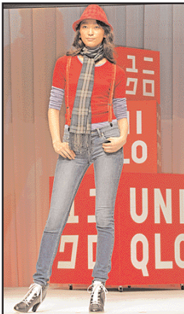
Japanese model An displays Japanese casual apparel giant Uniqlo's latest creation at their "women's bottom collection" in Tokyo. Uniqlo will open its flagship shop in Paris soon.