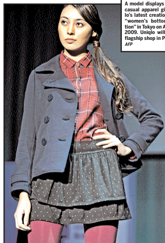
A model displays Japanese casual apparel giant Uniqlo's latest creation at their "women's bottom collection" in Tokyo on August 26, 2009. Uniqlo will open its flagship shop in Paris soon.