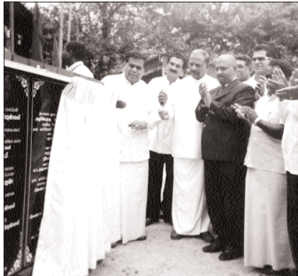
Healthcare and Nutrition Minister Nimal Siripala de Silva unveils a plaque for the proposed trade complex in Badulla. Minister Dinesh Gunawardena was also present.