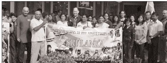
Funds were collected for the Api Wenunuwen Api program in Sweden. Here Sri Lankans living in Sweden after collecting the funds.