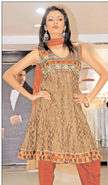
A model displaying some shawls