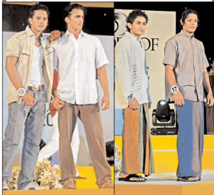
Models at the show.