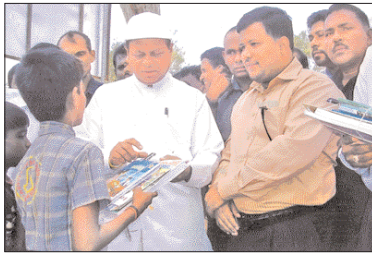
Minister of Education Susil Premajayantha visited the Menik Farm Welfare Village with a load of school books and equipment for displaced schoolchildren in the North, provided under the NENESA project of the Uthuru Vasanthana program. Here the Minister hands over a parcel of books and equipment to a child. Minister of Resettlement and Disaster Relief Services Rishard Badudeen was also present.