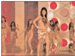
The contestants dancing the 'Macarena'