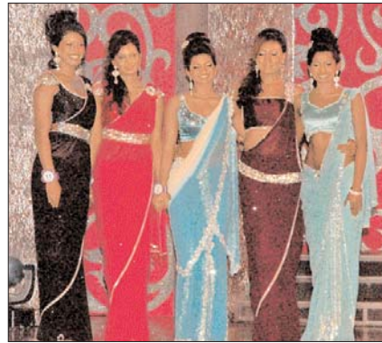
The top five.