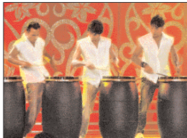
Nadro in action