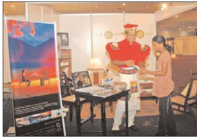
A creative stall at the Fair