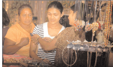
Women selecting jewellery