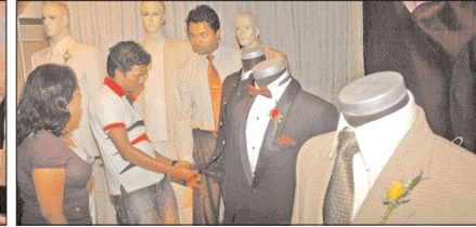
Visitors at the bridal show