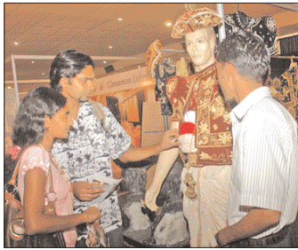
Selecting a costume for a Kandian bridegroom