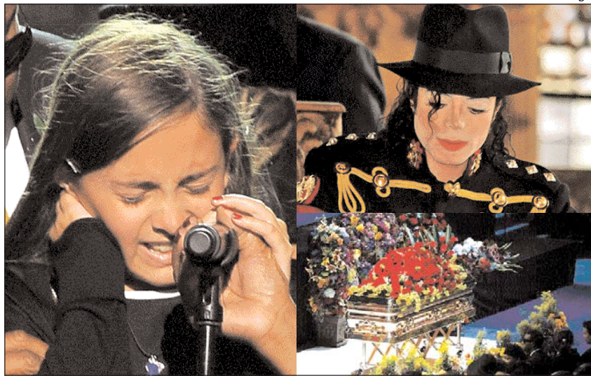
Paris Michael Katherine, daughter of Michael Jackson, cries as she speaks at the memorial service for her father held on Tuesday at the Staples Center in Los Angeles

So, some came today. Mrs. Jackson, to say goodbye to Michael, I came to say, thank you. Thank you because you never stopped, thank you because you never gave up, thank you because you never gave out, thank you because you tore down our divisions. Thank you because you eradicated barriers. Thank you because you gave us hope. Thank you Michael. Thank you Michael! Thank you Michael!