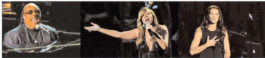
Musician Stevie Wonder performs at the service.

Stevie Wonder, Mariah Carey and Oscar-winner Jennifer Hudson were among the stars taking part in the service.