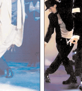
Tip-toe stand or that "Smooth Criminal" lean...

It was here that he met Quincy Jones, the music producer for The Wiz, who would later produce Michael's three most acclaimed solo albums, Off the Wall, Thriller and Bad. In 1979, produced a record four Top 10 hits and sold seven million copies in the United States. While performing "Billie Jean" during the Motown 25: Yester-