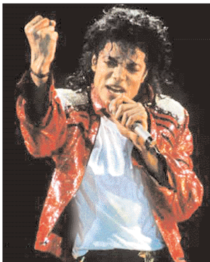
Michael, the legendary years

In 1994 Jackson married Lisa Marie Presley, the daughter of Elvis Presley; the marriage lasted less than two years, ending in divorce.