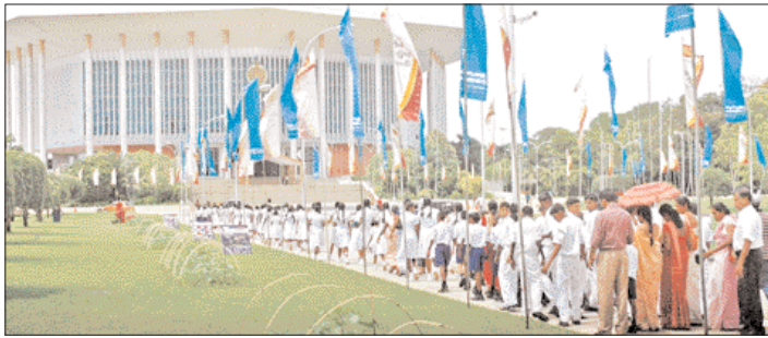
A large number of students attending the exhibition