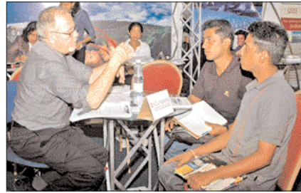
Higher education consultation from an expert