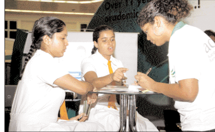
The ACBT stall at the exhibition

The exhibition was an extensive resource for school leavers, students and young professionals. Special focus was given to students who are about to complete their school education at the exhibition by the way of the "School Day" on June 19 which allowed prioritized access to students from both state and private schools around the country, fulfilling an important objective of Future Minds. The exhibition commenced last Friday.