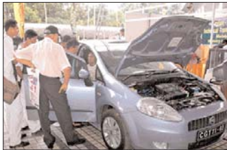
A stall at the exhibition