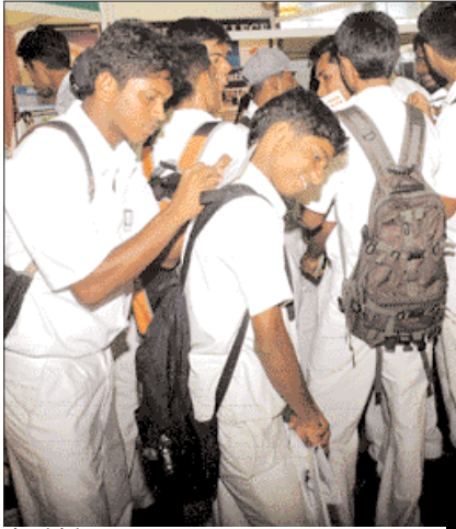
Very keen students