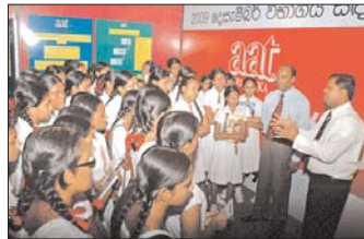
Students interested in AAT