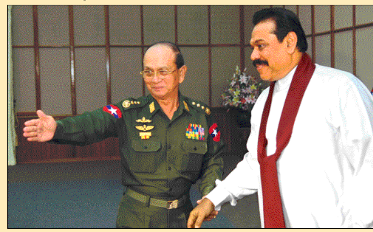
President Mahinda Rajapaksa pays a courtesy call on Prime Minister of the Union of Myanmar General Thein Sein.