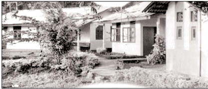
Front view of Camilla School