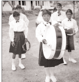
Camilla School band