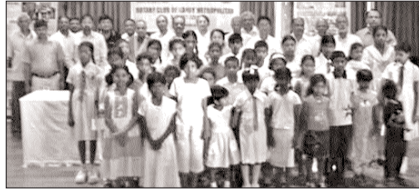
Children along with their parents, who received the funds from Rotary Club of Kandy Metropolitan.