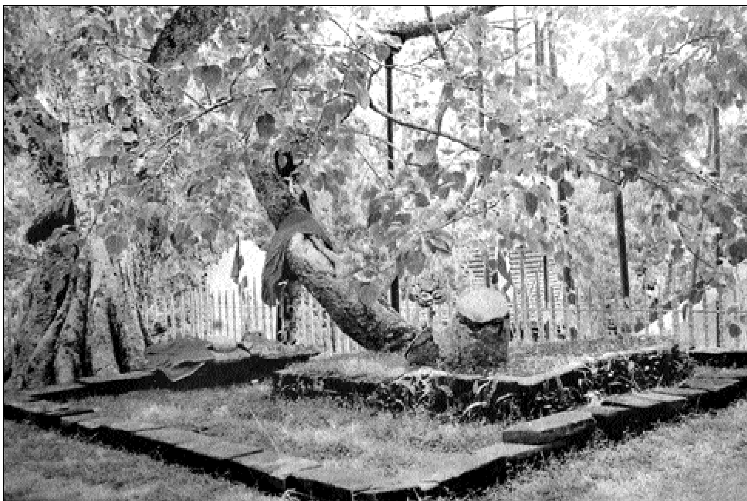
The Jaya Sri Maha Bodhi in Anuradhapura