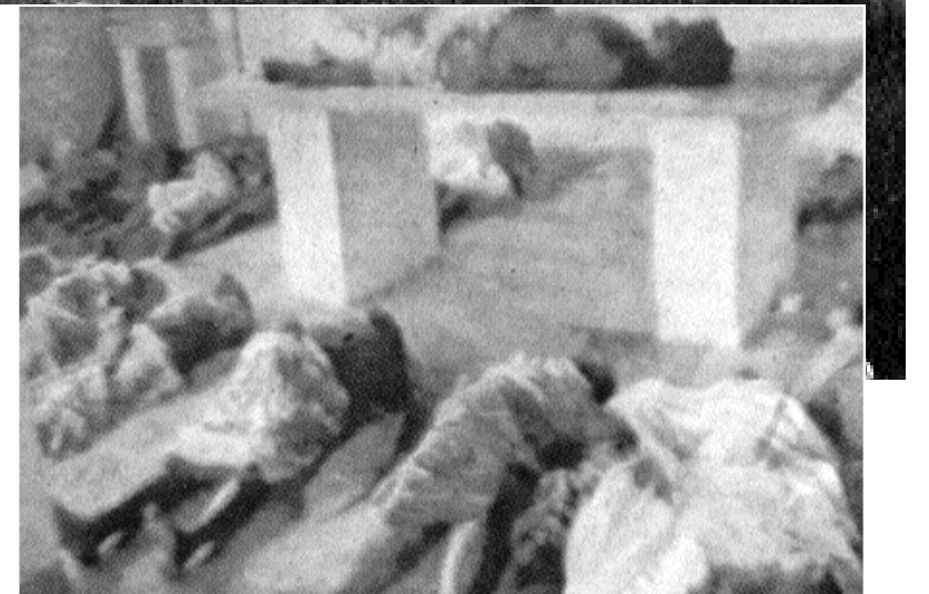
A section of those killed