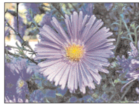
A purple Aster

Kingdom : Plantae (unranked): Angiosperms (unranked): Eudicots (unranked): Asterales Order: Asterales Family: Asteraceae Tribe: Asteroideae Genus: Aster