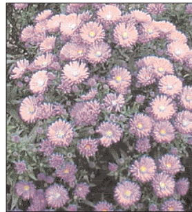
Aster in bloom

In the UK there are only two native members of the genus of which one, Goldilocks is very rare, the other being Aster tripolium , the Sea aster. The Aster alpinus vierhapperi is the only species native to North America. Source: Wikipedia