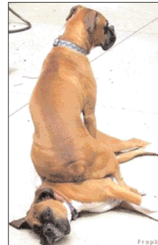
You ain't going anywhere, buddy