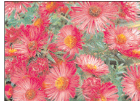
Deep pink Aster