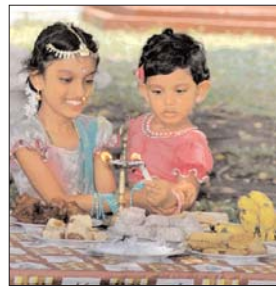
Auspicious time.

When the sun moves from the Meena Rasi (House of Pisces) to the Mesha Rashiya (House of Aries), it signals the dawn of the Sinhala and Hindu New Year.