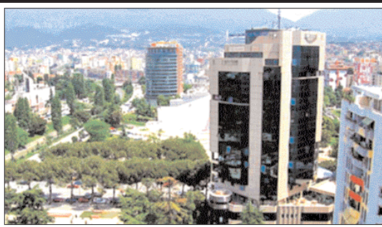
Tirana is the Capital and largest city of the Republic of Albania. It was founded in 1614 by Sulejman Pasha and became Albania's capital city in 1920.

Albania, officially the Republic of Albania is a country in South Eastern Europe. It is bordered by Greece to the South-East, Montenegro to the North, Kosovo to the North-East and Macedonia to the East. It has a coast on the Adriatic Sea to the West and on the Ionian Sea to the South-West.